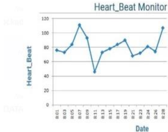
Graph of Heart beat monitor a