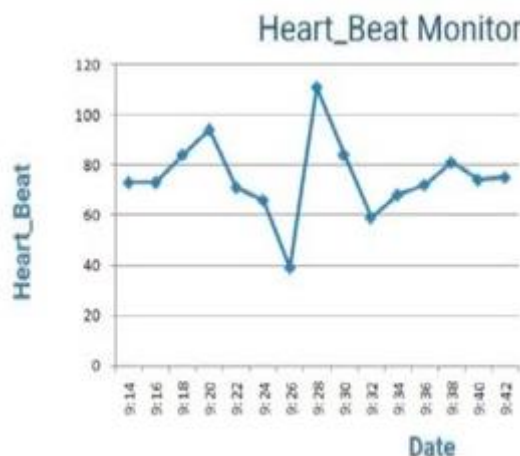
Graph of Heart beat monitor b